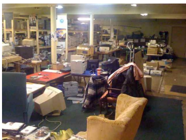
Free Geek Columbus

Faculty Learning Community on Sustainability Across the Curriculum