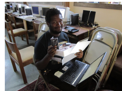
Community Computer Lab